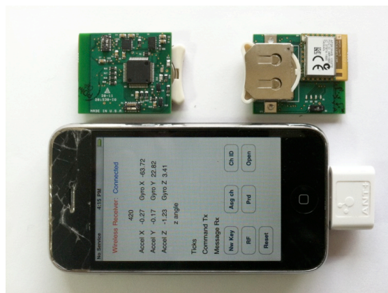
Figure 2: a. Back (top left) and Front (top right) of prototype devices, b. iPhone (bottom) c. Fisica Key (bottom right)

Wahoo Fitness manufactures ANT+ Fisica Key, an ANT transceiver dongle for the iPhone/iTouch. For developers, they also provide an API to configure, transmit and receive messages from the dongle. This dongle is used as the RF interface between the iPhone and the activity monitoring device. An objective-C app written in the Xcode developer environment for iOS 4.2 provides the user interface and feedback.